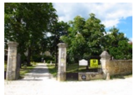
A 'Sublett' Family property